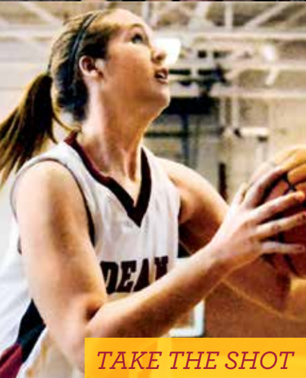
TAKE THE SHOT